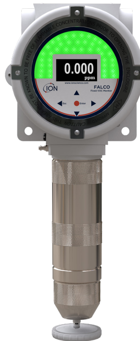
Pumped 10.6 eV model

Registering your product online within one month of purchase will extend its warranty.