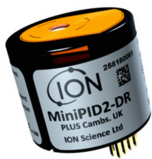
MiniPID 2 sensor